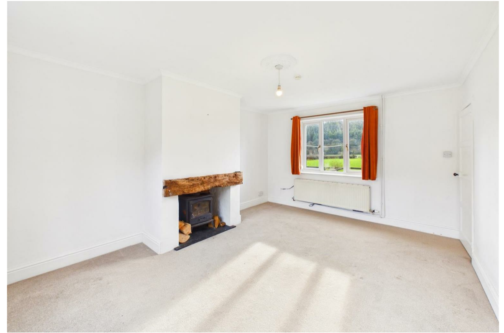
Near Meifod, Powys £1,100

A beautifully presented three bedroom semi-detached cottage located in a rural setting situated near Meifod, Powys. *See virtual tour*